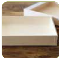
Large Tray – 2"