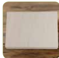
Large Tray – 2" Attached Lid