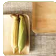
9" x 9"