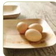
8" x 8"