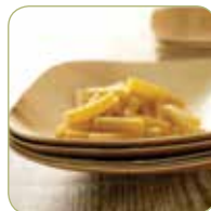
6" x 8"