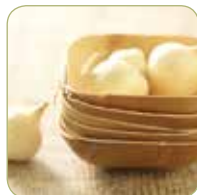
4" x 4"