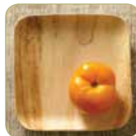
8" x 8"