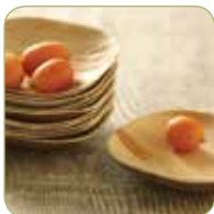
4" x 4"