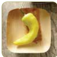
6" x 6"