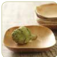
6" x 6"