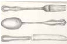
Fork, Knife, Spoon