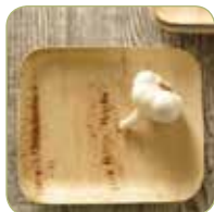
7" x 8.5"