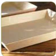
Large Tray Fixed Side