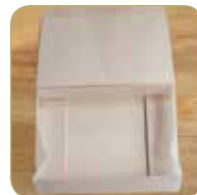
Large Tray – 3" Attached Lid