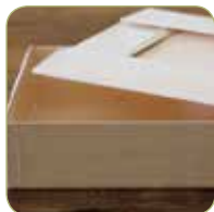
Large Tray – 3"